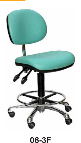
Vinyl Cleanroom Chair with Filter

A durable cleanroom chair constructed with a cushioned seat and upholstered in antibacterial vinyl that can be easily cleaned. Ideal for cleanroom, laboratory, food and medical industries.