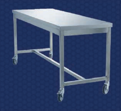
Stainless Steel Table With Castors