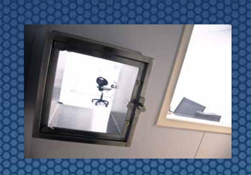
Trespa and Stainless Steel Pass Through Hatches