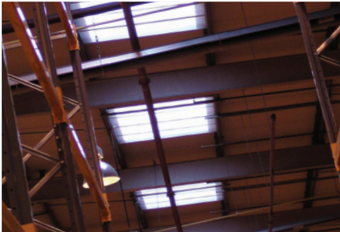
Filites installed in a large warehouse to increase light levels

FILON Filites are unaffected by temperature changes from -20°C to 100°C. They will not become brittle at low temperatures and they will not soften, discolour or warp at high temperatures.