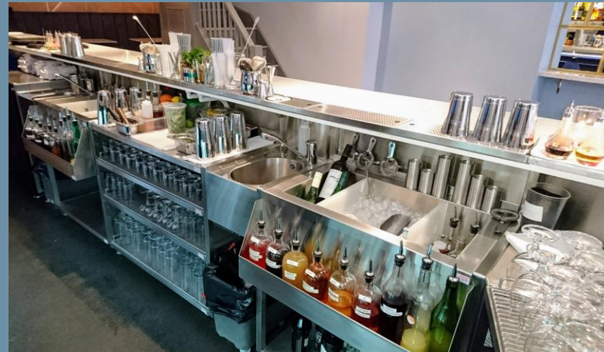
Cottonmouth, Nottingham – Back of Bar