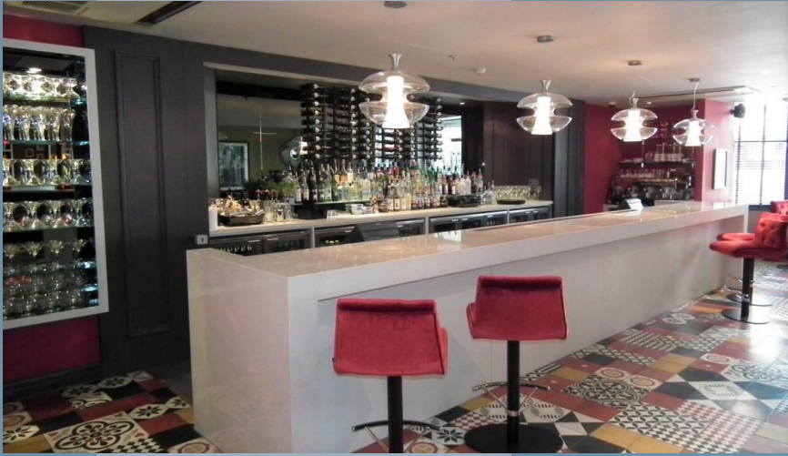
Nicholson's Bar (Hilton), Nottingham – Customer Facing