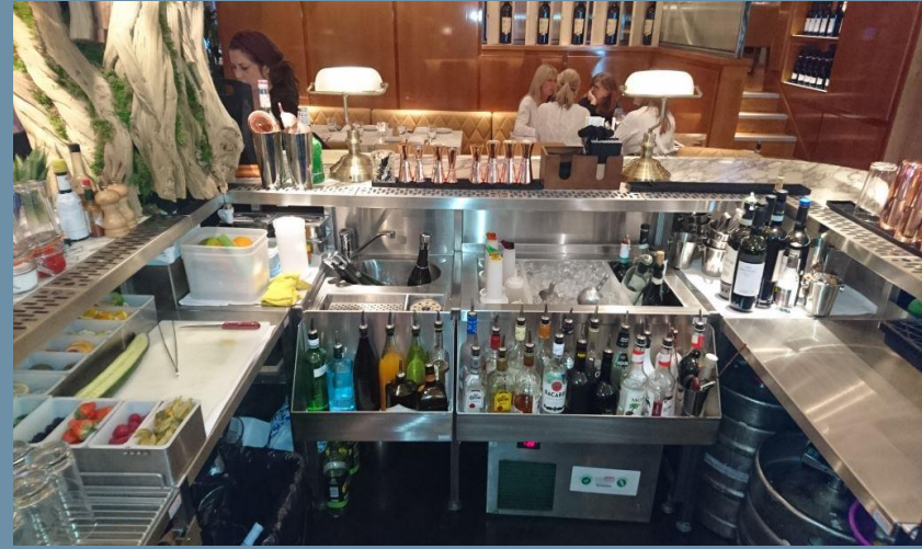
Cibo, Altrincham – Back of Bar