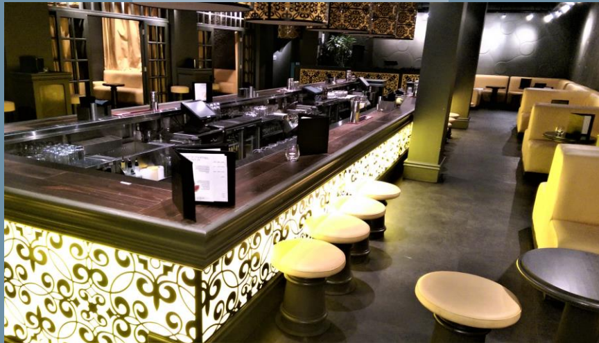
The Milton Club, Manchester – Customer Facing