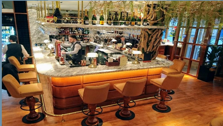
Cibo, Wilmslow – Customer Facing