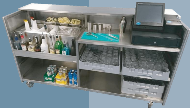
MOVERBar - Cocktail Servery MB1990C - £4,490