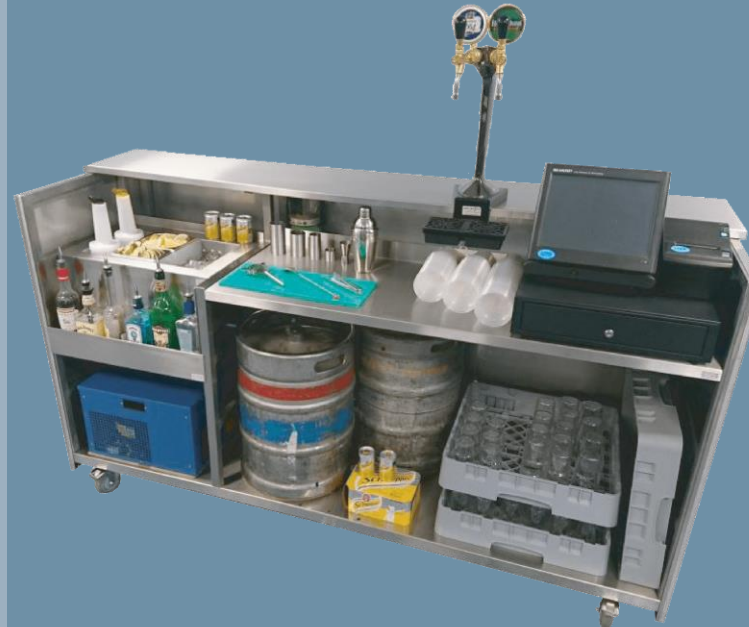
MOVERBar - Beer Dispense & Cocktail Servery MB1990BC - £4,220