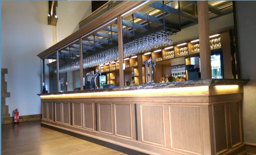
Alnwick Castle, Alnwick – Customer Facing