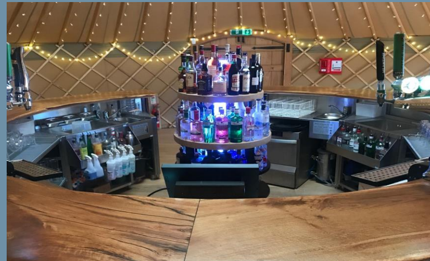
Cripps Thorpe Garden, Tamworth – Back of Bar