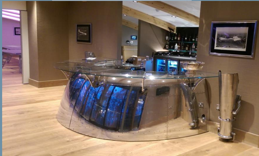
Bowlcliffe Hall, Wetherby – Customer Facing