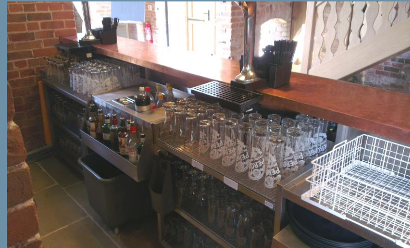
Cripps Barn Shustoke, Coleshill – Back of Bar