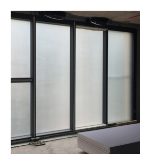
Protectapeel is quickly applied by airless spray or roller and does not lose adhesion, providing 12 months of superior protection. When removed it reveals clean and undamaged surfaces

Our liquid-applied, peelable, protective coating dries to form a skin-tight barrier. Protectapeel makes protecting curved/uneven surfaces effortless. Before project handover, Protectapeel is simply removed by hand peeling. Surfaces are clean and damage-free preventing delays due to additional cleaning & replacements. Protectapeel is an environmentally friendly protective coating.