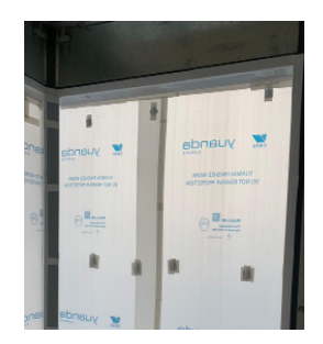
Protective board is time consuming to apply and can trap debris underneath, causing delays and additional cleaning