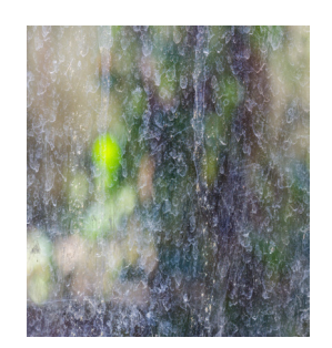
No protection can cause additional expense and time consuming damage and cleaning requirements