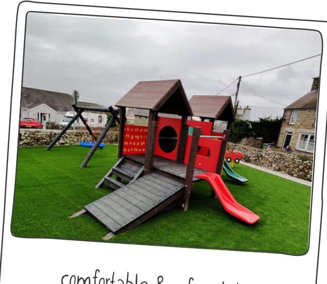
comfortable & safe solution

The Artificial Grass we supply and install consists of shock pads and absorbent layers to meet the current safety surfacing standard of BSEN 1177.